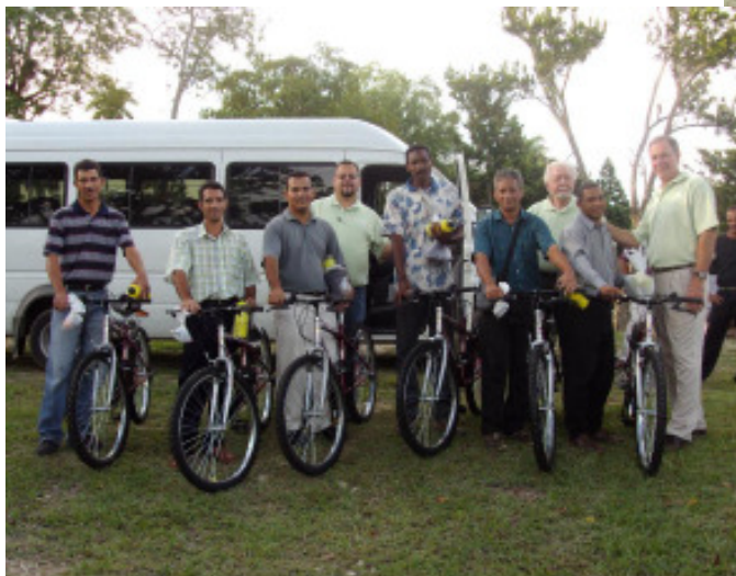
Pastor's Bicycle Gifts