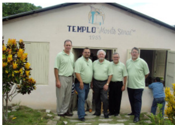
Our USCC Team