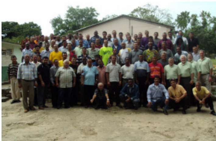
2009 Cuba Men's Ministries Conference