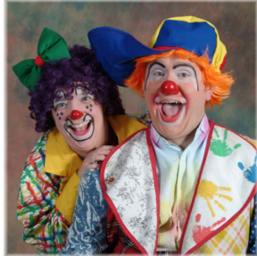
Joy Set Special Guests

August 29, 2009 Upper South Carolina Conference Campgrounds 9:00 A.M. - 1:00 P.M.